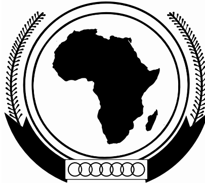
The emblem of the AU

40 The overlapping circles on the bottom of the emblem below symbolise African Solidarity and the blood that was shed to liberate Africa. What was Africa freed from?